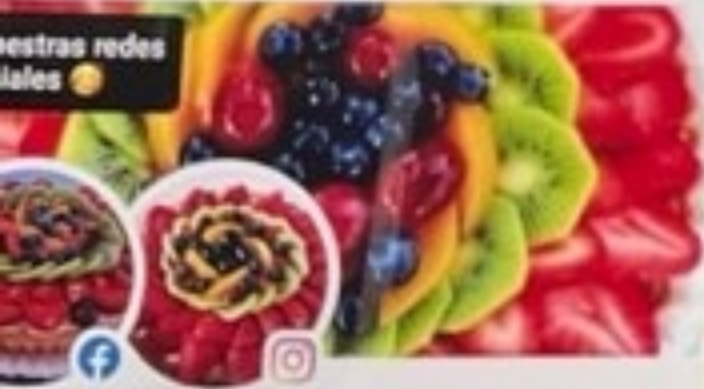
y's Fruit Tarts